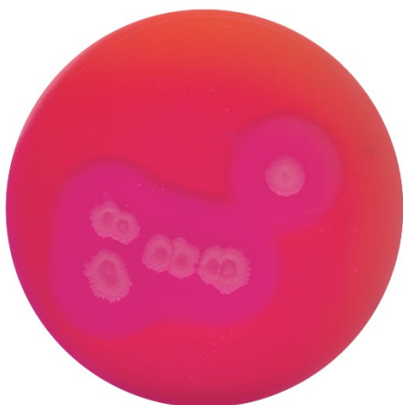
Bacillus cereus ATCC® 11778 on MYP agar

Please refer to the actual batch related Certificate of Analysis.